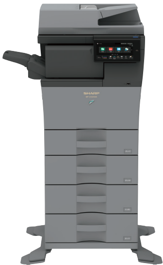
BP-C545WD shown with Inner Finishing Unit in a 4-drawer configuration.