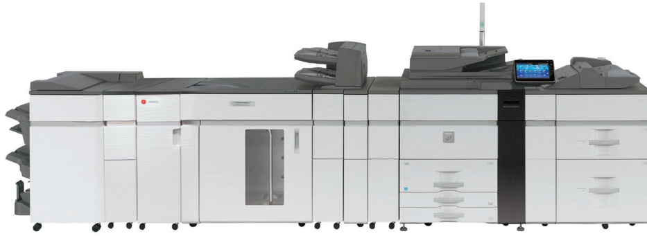
MX-M1204 High Speed Monochrome Document System shown with GBC SmartPunch Pro.