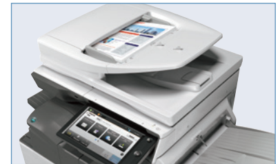
The Sharp ImageSEND™ feature provides one-touch distribution to email, cloud applications and more.