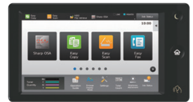
Award-winning 10.1" (diagonally measured) customizable touchscreen display.