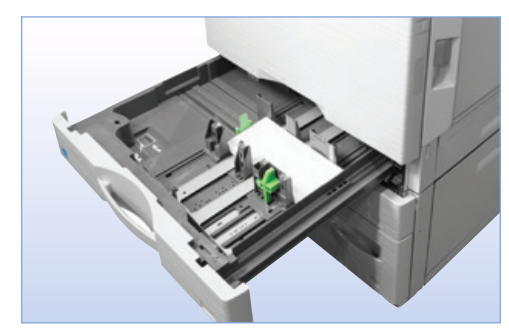
Feeds up to 50 envelopes from the standard paper tray.