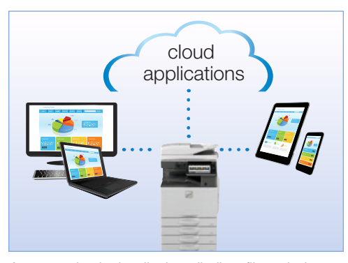
Access popular cloud applications, distribute files and print documents more easily