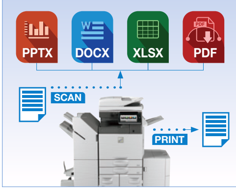
Scan and convert documents to popular file types seamlessly with the Sharp built-in OCR function.