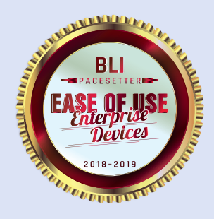
"PaceSetter Award in Ease of Use 2018–2019"