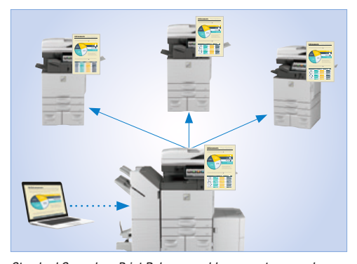
Standard Serverless Print Release enables users to securely print a job and release it from up to six supported models on the same network