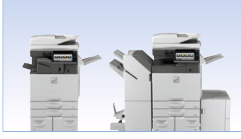
MX-M4071S shown in both a compact configuration with inner finisher and full configuration with saddle stitch finisher and large capacity cassette.