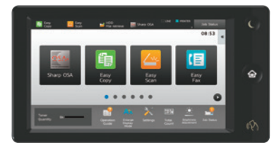
Award-winning 10.1" (diagonal) customizable touchscreen display.