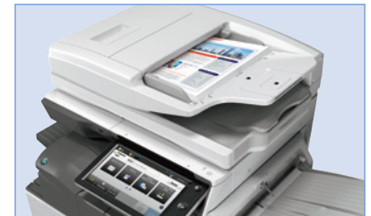
The Sharp ImageSEND™ feature provides one-touch distribution to email, cloud applications and more.