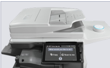
MX-M6071S shown with available Sharp MFP Voice feature with Alexa.