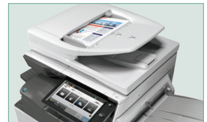
Sharp's ImagesEND™ feature provides one-touch distribution to email, cloud applications and more.