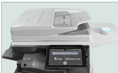
MX-M4051 shown with available Sharp MFP Voice feature with Alexa.