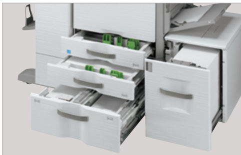
Up to 6,600-sheet paper capacity with available options.