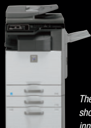
The MX-M564N shown with compact inner finisher.

On-board Document Storage Sharp's easy-to-use document filing system enables users to store frequently used files.