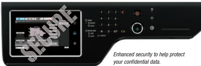
Enhanced security to help protect your confidential data.

The MX-M364N/464N/564N Essentials Series offers several layers of standard security to protect your business and user information . Standard features include data encryption, data overwrite protection, confidential printing and more. And, with Sharp's convenient End-of-Lease feature , all job data and user data can be easily erased at time of trade in.