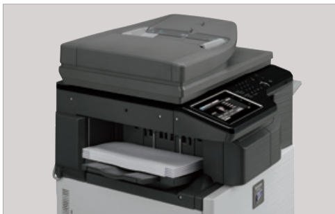
Available compact inner finisher with 50-sheet staple capacity.

A full-featured MFP that is also a strong value – the MX-M364N/M464N/M564N Essentials Series monochrome document systems will exceed your expectations.