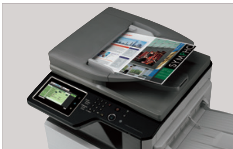
Standard 100-sheet RSPF scans up to 56 images-per-minute.