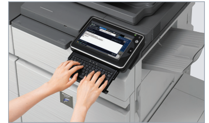
Standard retractable keyboard simplifies data entry