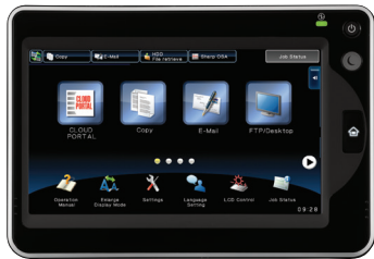
Tablet-style touch-screen display with intuitive menu navigation.

The Sharp MX-M654N and M754N monochrome workgroup document systems deliver high productivity and strong versatility.