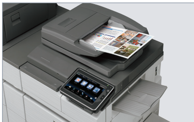
Single pass, dual side scanning at up to 200 IPM