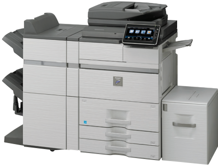
MX-M754N shown with options.