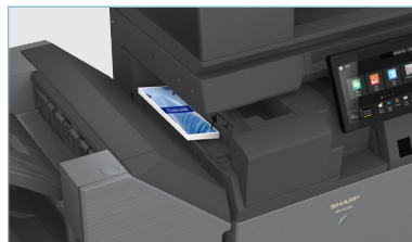
Inner Folding Unit option offers a variety of fold patterns, including c-fold, z-fold and others.