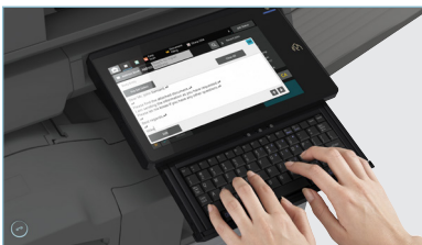
Built-in retractable keyboard simplifies email address and subject line entries.