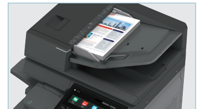
High capacity 300-sheet DSPP scans documents at up to 300 images per minute.