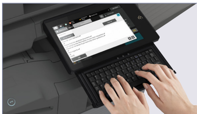
Built-in retractable keyboard simplifies email address and subject line entries.