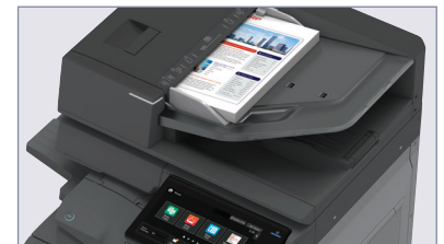
High capacity 300-sheet DSPP scans documents at up to 300 images per minute.