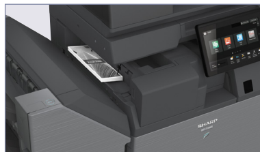
New Inner Folding Unit option offers a variety of fold patterns, including c-fold, z-fold and others.