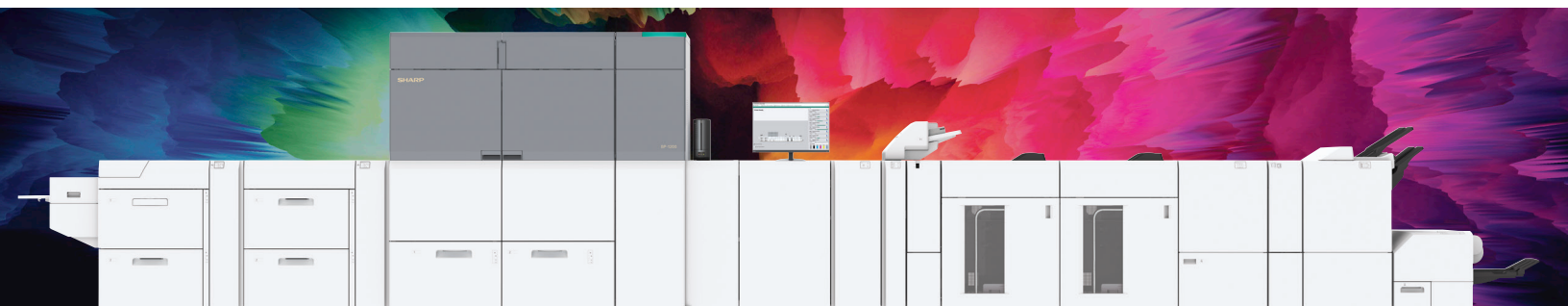
The BP-1200S Color Press Series shown in a full configuration.

The Color Press Series from Sharp delivers unrivaled capabilities to digital printing. With stunning 4-color imaging that can be augmented with printing of up to 6 specialty colors in one pass, the Sharp Color Press Series can make your print jobs virtually come to life. Create a variety of metallic effects with Silver and Gold underlay or add bright Pink for an innovative, eye-catching design.