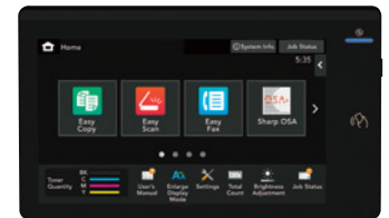
10.1" (diagonally measured) customizable touchscreen display.