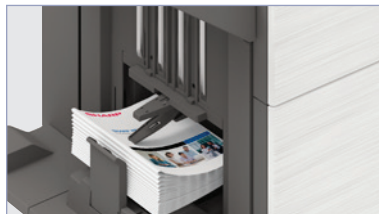
Finishers keep large print jobs neatly stacked with the unique jogger mechanism.