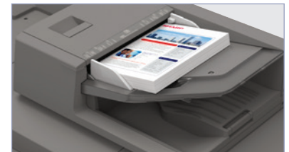
High capacity 300-sheet DSPF scans documents at up to 300 images per minute.