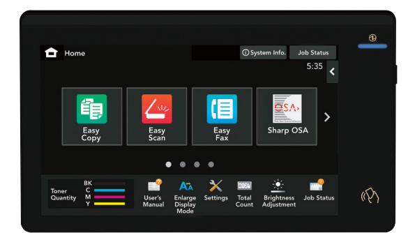
Sharp's user-friendly touchscreen display is customizable for convenience and common among 30+ other models.

Network Friendly – Sharp MFPs integrate seamlessly with today's modern healthcare environments, support the latest communication and security protocols. Most models also offer optional Bitdefender antivirus protection.